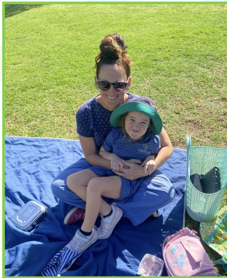
PBS Day Community Lunch