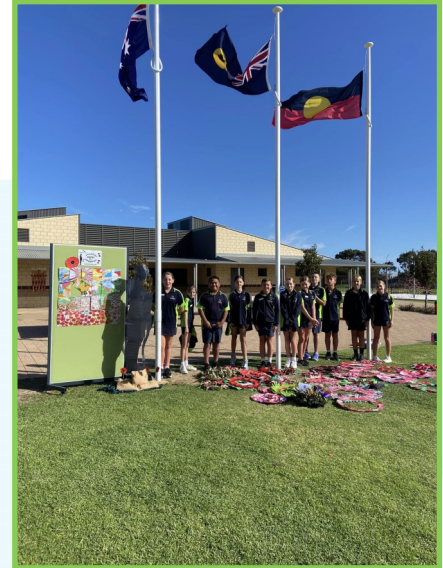
The Student Leaders led the ANZAC Service amazingly